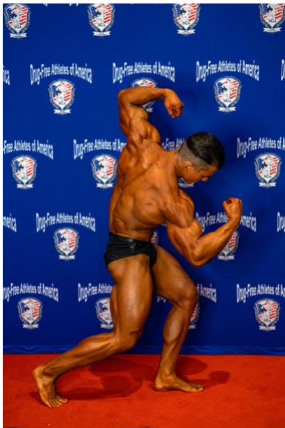
Classic Pose "A"