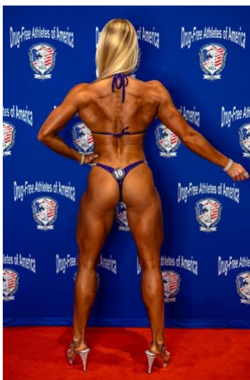
Back Pose "A"